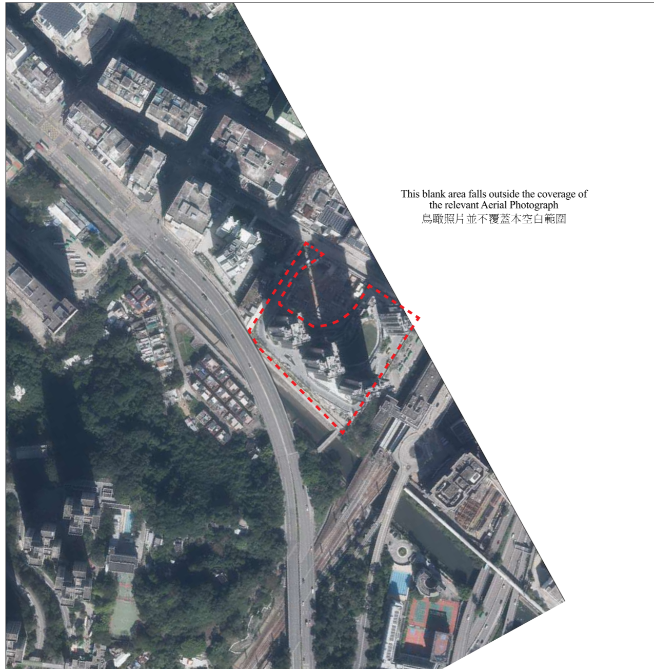
Location of the Development 發展項目的位置

Adopted from part of the aerial photograph taken by the Survey and Mapping Office, Lands Department at a flying height of 6,900 feet, photo No. E173692C, date of flight: 18 December 2022.